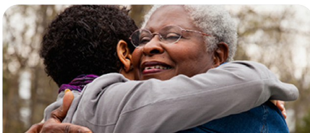
Patient engagement and support